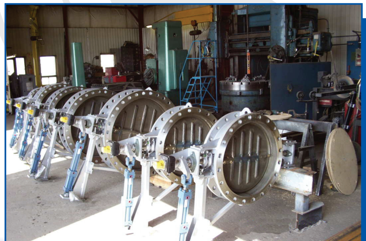
Wind Tunnel Emergency Vent Control Valves US. Air Force Base, Tullahoma TN. USA